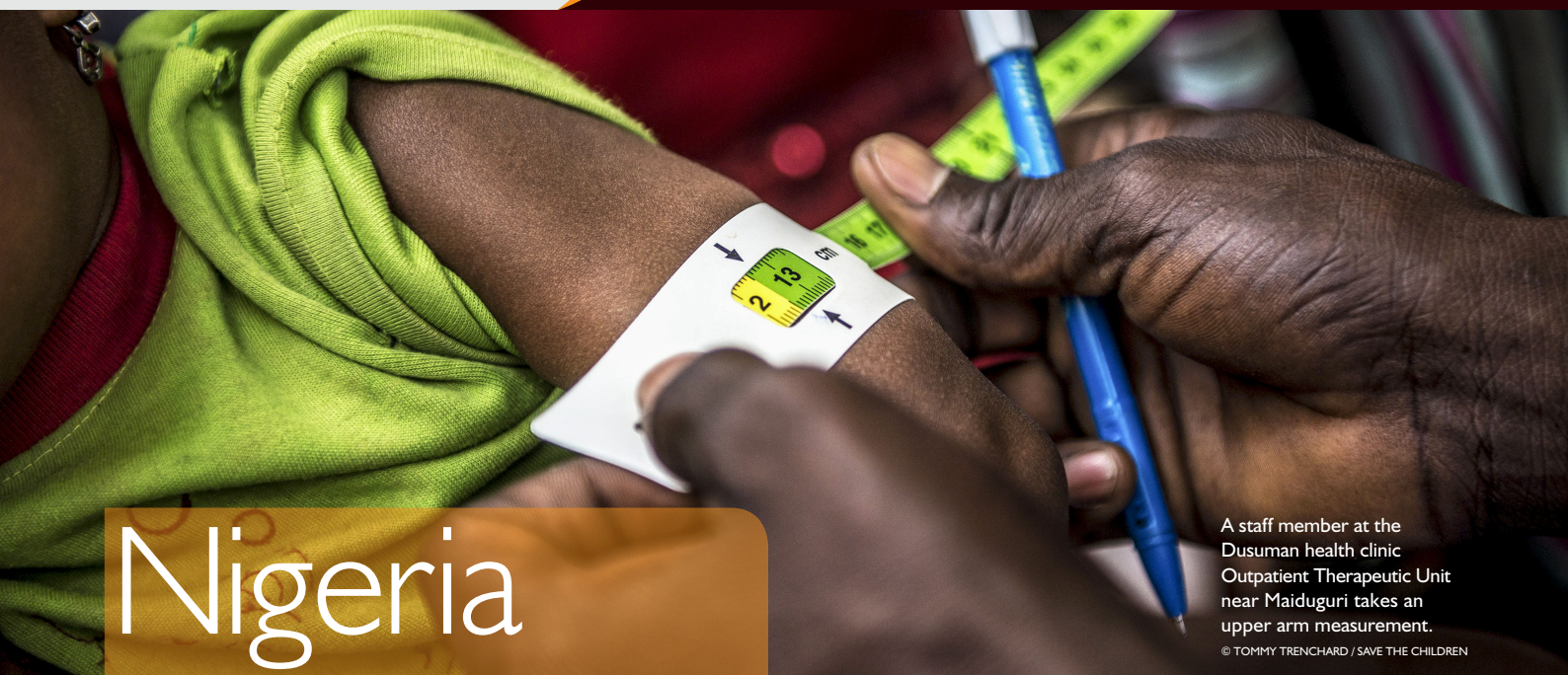
A staff member at the Dusuman health clinic Outpatient Therapeutic Unit near Maiduguri takes an upper arm measurement.